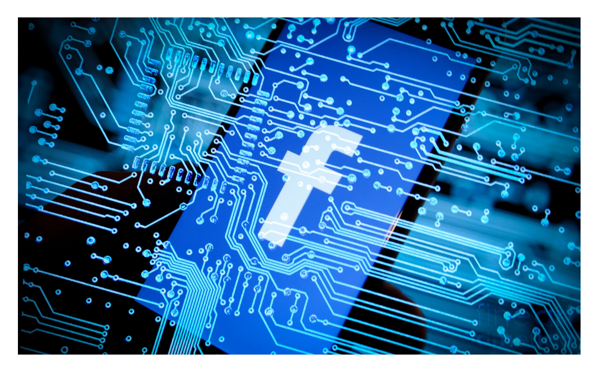
Cyber Opportunities: Economy,Research & Innovation

The satellites today are a vital part of our lives and they are essentials for the management of telecommunications and Internet. But they are not exempt from risks of hacking and cyber threats. They can be used as a vector for cyber attacks of different kinds as they have different points of vulnerability.