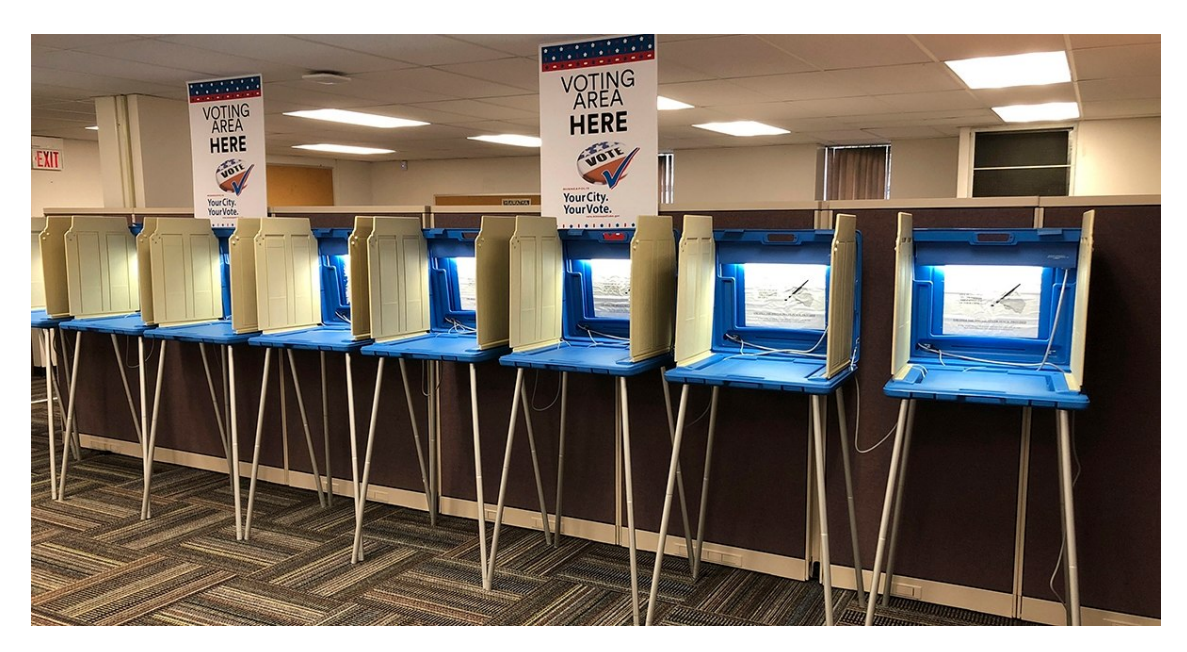
Cyber Policy, Diplomacy & Legal Framework