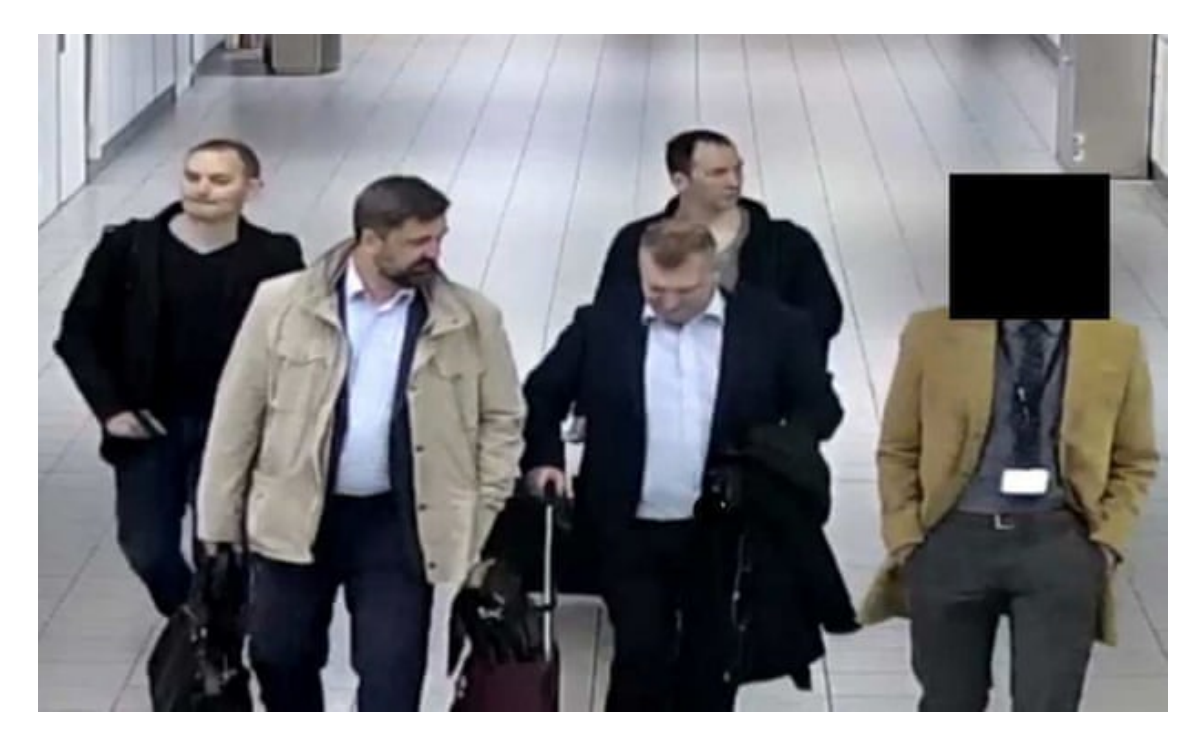
Cyber Policy, Diplomacy & Legal Framework