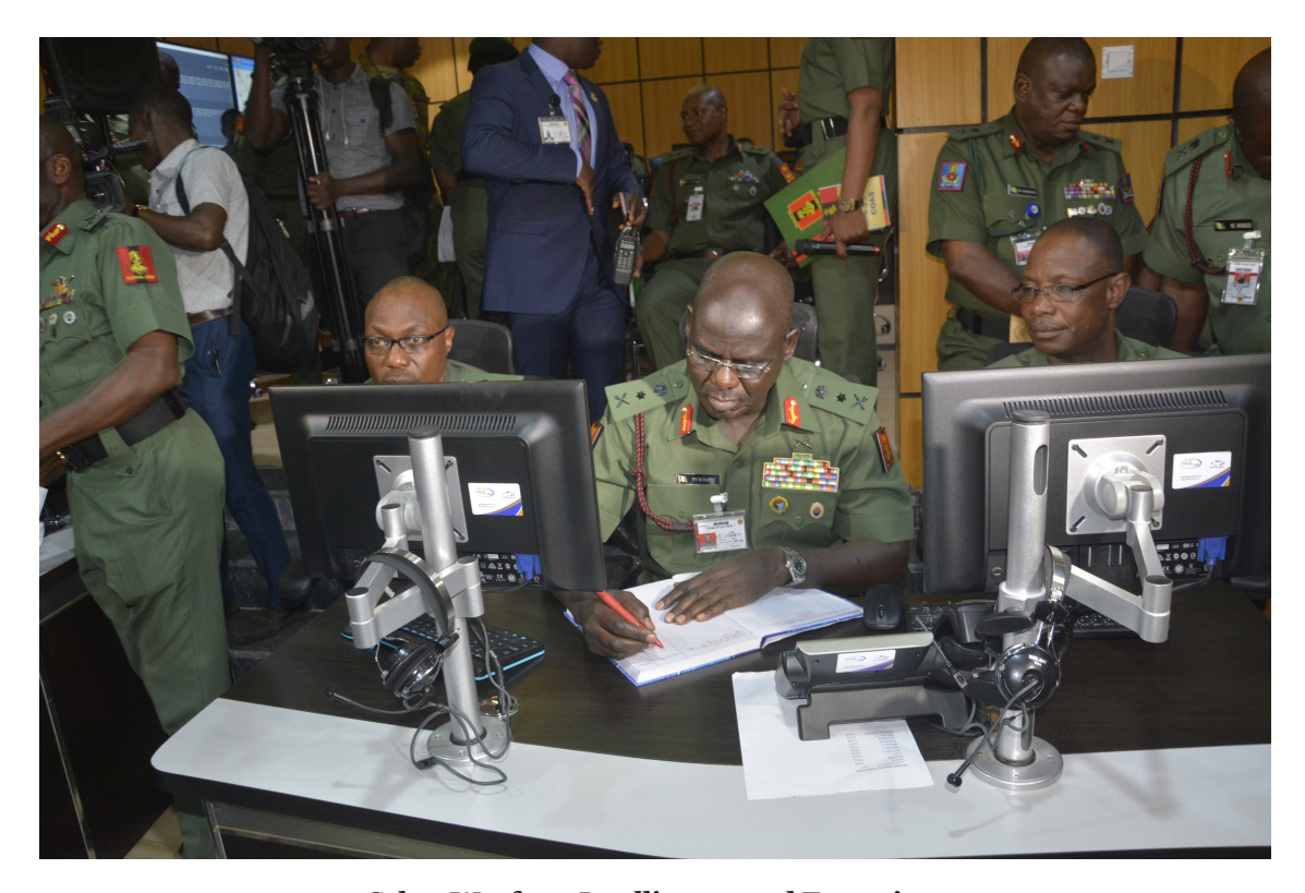
Cyber Warfare, Intelligence and Terrorism

Equifax Inc. failed to modernize its technology security to match the company's aggressive growth strategy and data gathering, a shortcoming that left it open to the 2017 hack that compromised the information of 148 million people, according to a House Oversight Committee report.