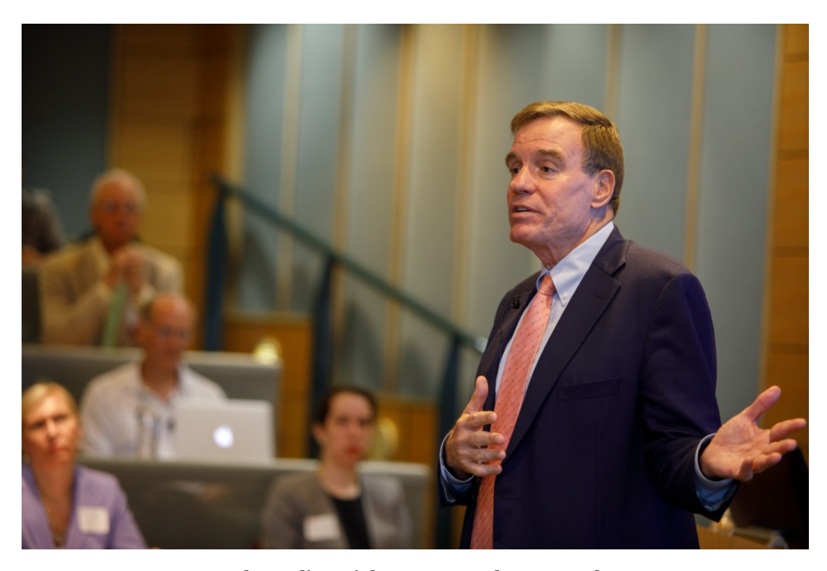
Cyber Policy, Diplomacy & Legal Framework