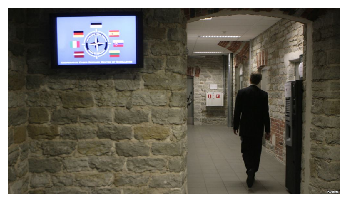
Cyber Warfare, Intelligence and Terrorism

A vulnerability was found in messaging app Telegram due to a voice call bug. The IP addresses of users appeared in the logs stored in telegram servers for hours instead of being encrypted