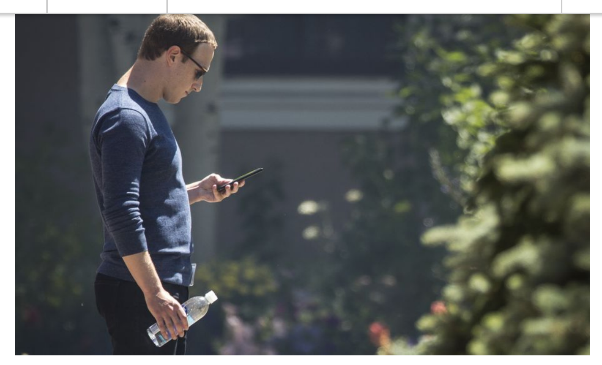
Cyber Opportunities: Economy,Research & Innovation